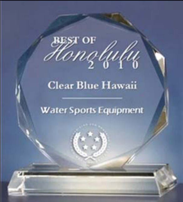
2010 Best of Honolulu U.S. Commerce Association